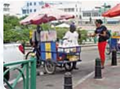
Representative of the Informal Sector: Snowcone Vendor