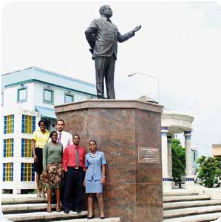
Independence Square, staff of the BSS beside statue of the Rt. Excellent Errol Barrow, 1st Prime Minister and National Hero

Timely and reliable statistics inform decisions made by the public sector, the private sector and by the general public. In order to achieve the vision for Barbados, it is necessary to provide an adequate framework for the production and dissemination of statistics