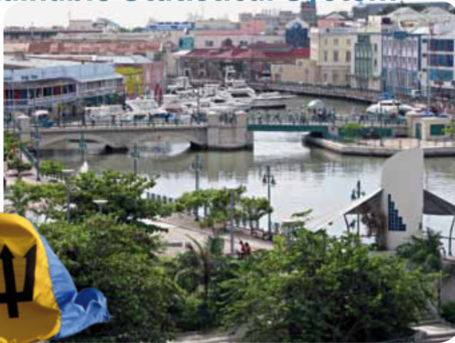
Bridgetown, the Capital of Barbados