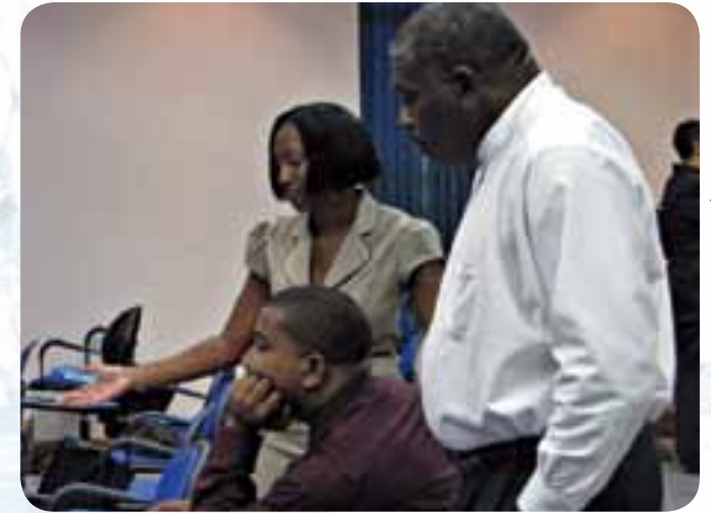
Staff of the BSS, working on the development of "BimInfo", a statistical database