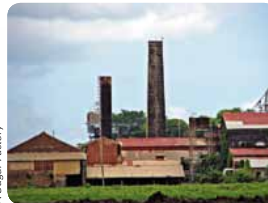
A Sugar Factory