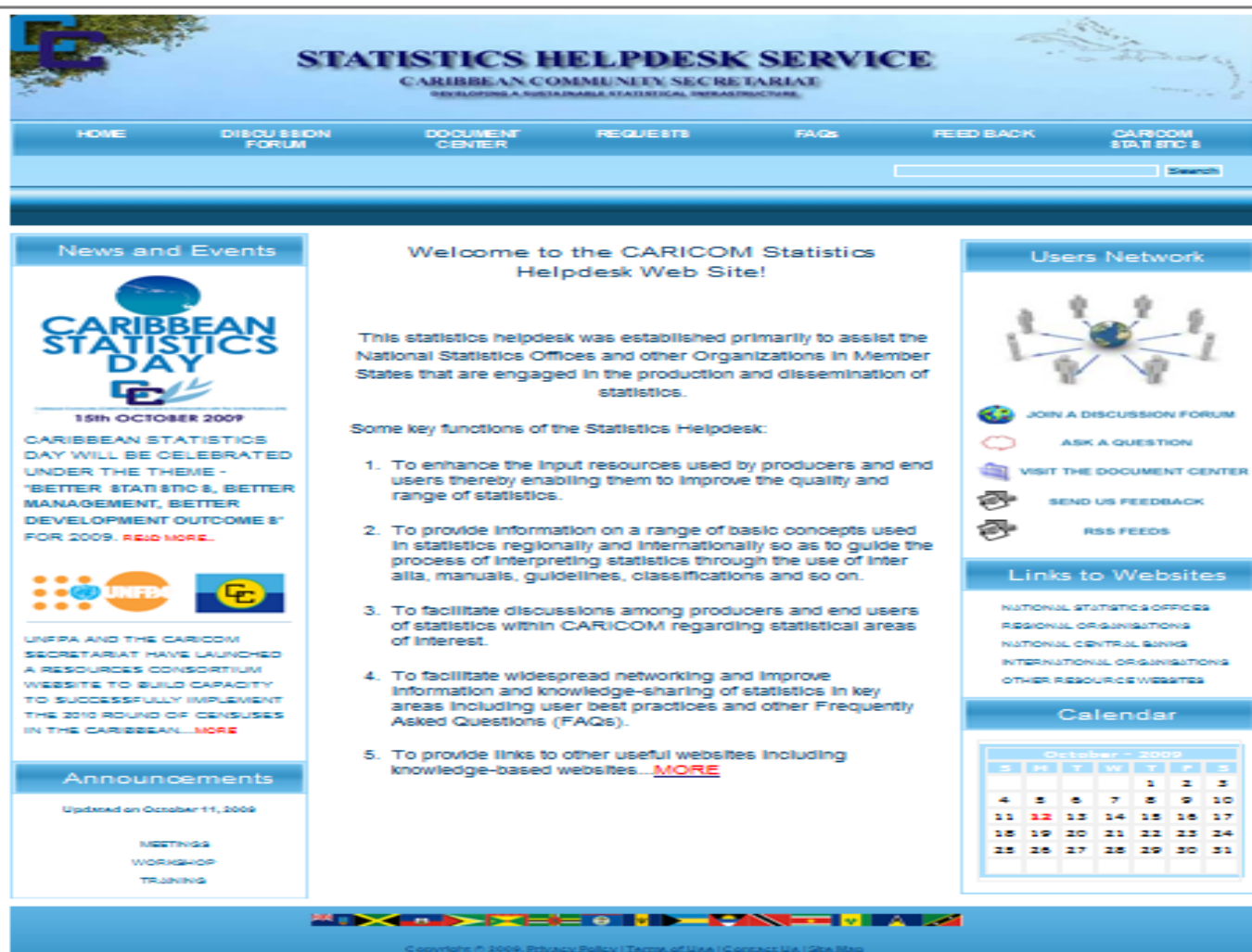
Figure 1: Site Homepage