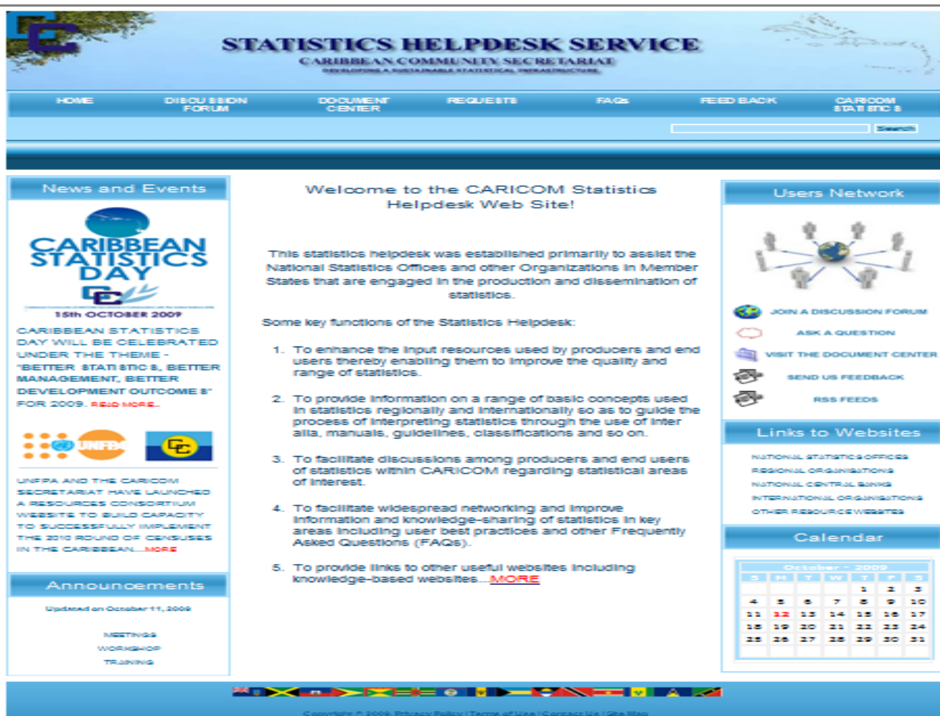
Figure 1: Site Homepage